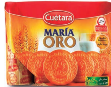
MARIA ORO CERTIFIED 800 GR REF: 46540 / 44314 / 44238