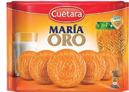
MARIA ORO 900 GR REF: 50890