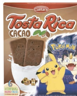
TOSTARICA CACAO 570GR* REF: 45348