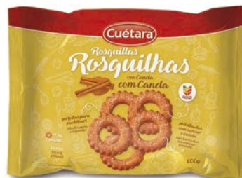
ROSQUILLAS CANELA 450 GR REF: 48387