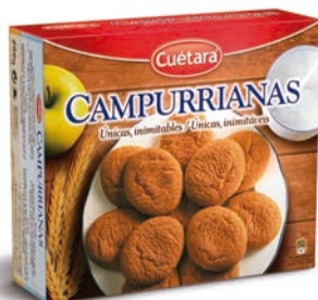
CAMPURRIANAS 500 GR REF: 48775