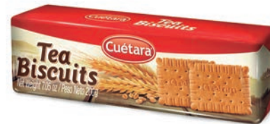
TEA BISCUITS 200 GR REF: 44321