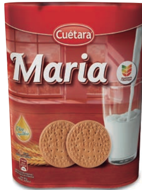
MARIA 400 GR REF: 44699