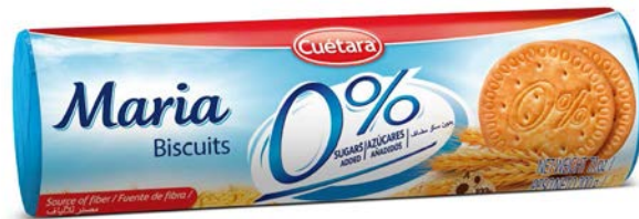
0% MARIA BISCUITS 200GR *12 REF: 57155