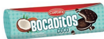
BOCADITOS COCO 160 GR REF: 48916