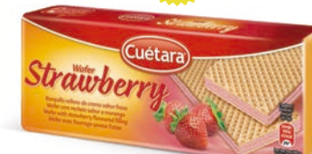
STRAWBERRY WAFER 150 GR REF: 56461 / 56448