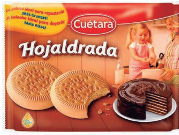
HOJALDRADA 600 GR REF: 43955