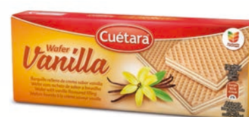
VANILLA WAFER 150 GR REF: 44288 / 46672