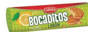
BOCADITOS LIMÓN 150 GR REF: 47119