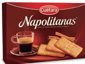
NAPOLITANAS 500 GR REF: 46636 / 44328 / 46884