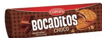
BOCADITOS CHOCOLATE 150 GR REF: 49017