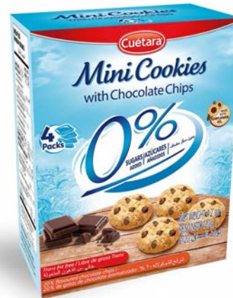
0% MINI COOKIES 120GR *12 REF: 56287