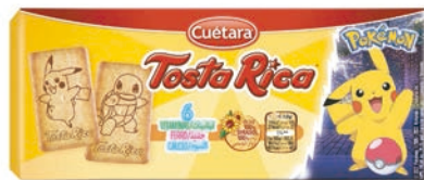
TOSTA RICA 190 GR INTERNACIONAL * REF: 52682 / 57802