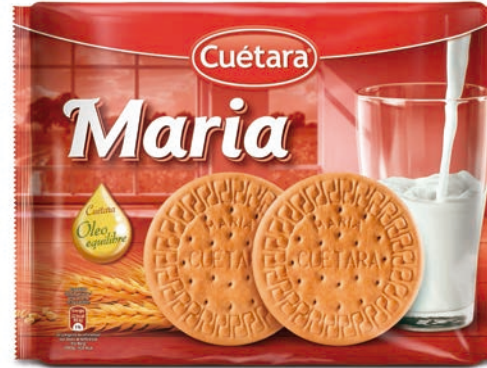
MARIA 800 GR REF: 43960 / 46333