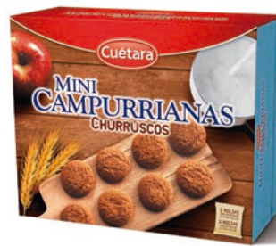
MINI CAMPURRIANAS 600 GR REF: 46077