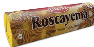
ROSCAYEMA 225 GR REF: 44647