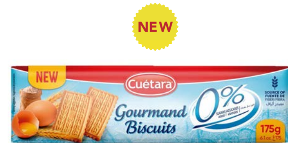
GOURMAND BISCUITS 0% 175GR *12 REF: 61041