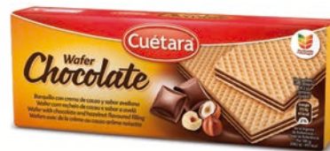
CHOCOLATE WAFER 150 GR REF: 44287 / 46669