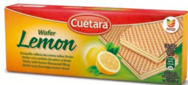
LEMON WAFER 150 GR REF: 50641 / 46671