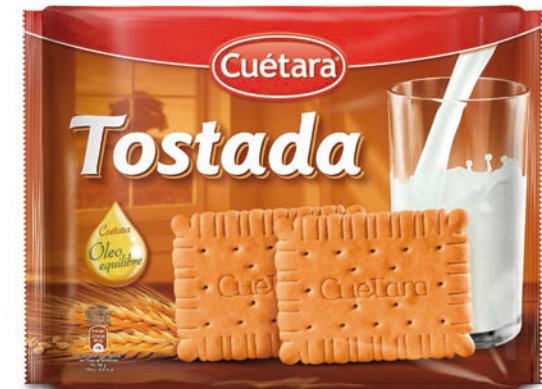
TOSTADA 800 GR REF: 44042