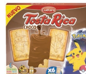
TOSTA RICA CHOCO 210GR REF: 59848