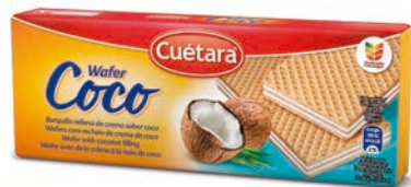
COCONUT WAFER 150 GR REF: 44286 / 46670