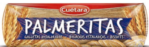
PALMERITAS 165 GR REF: 46638 / 55198