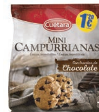
MINI CAMPURRIANAS CHOCO 145 GR REF: 52086