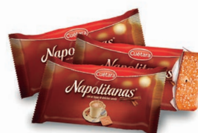
NAPOLITANA CORTESIA 860 GR REF: 46906