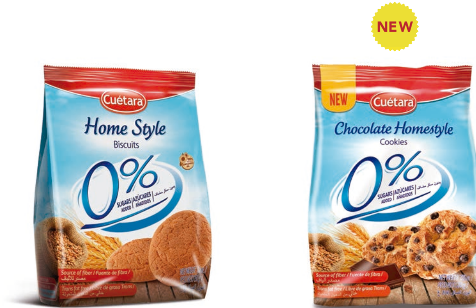
0% HOME MADE STYLE 150GR *7 REF: 50046