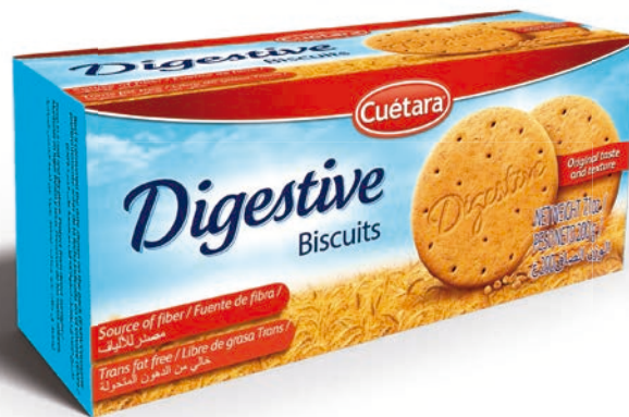
DIGESTIVE 200 GR NEW *12 REF: 50010