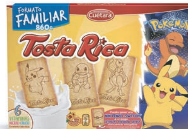
TOSTA RICA 860 GR * REF: 48648