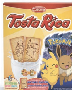
TOSTA RICA 570GR* REF: 54124 / 54123