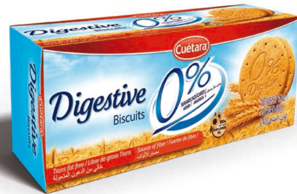
0% DIGESTIVE 400 GR NEW *15 REF: 49915