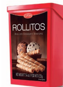
ROLLITOS 225 GR REF: 46637 / 55197