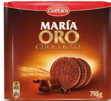
MARIA ORO CHOCO 795 GR REF: 47980