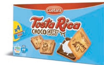
TOSTA RICA CHOCOQUAY 168 GR INT REF: 53764 / 46639 / 48401