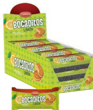
BOCADITOS LIMÓN 38 GR REF: 48279