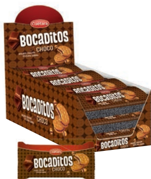
BOCADITOS CHOCOLATE 38 GR REF: 48282