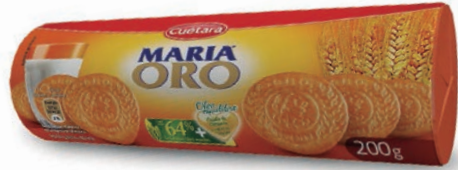
MARIA ORO 200 GR REF: 44696