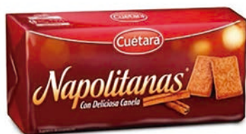
NAPOLITANAS 213 GR REF: 52988