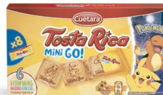
MINI TOSTA RICA GO EST.240GR* REF: 48405 / 53744